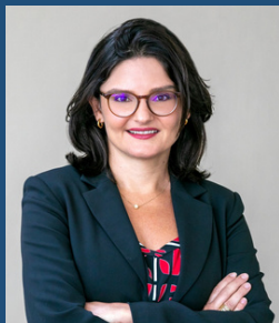
Tatiana Prazeres Brazilian Foreign Trade Secretary

12:05 PM EST - Multilateralism, Regionalism, or What?